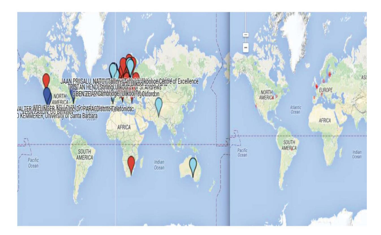
Figure 3. Comparison of data containing SSIDs.